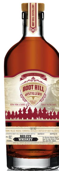
RED EYE WHISKEY

NOSE: Prominent notes of sweet butterscotch and heavy oaks with a delicate floral finish.