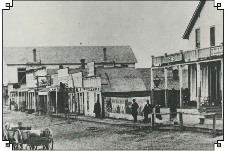
DODGE CITY FRONT STREET, 1880